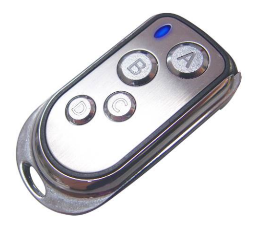
W-2 Wireless Transmitter

Wireless remote control system W-2 consists of a transmitter equipped with four buttons to turn faze output on or off, and adjust output volume; with an onboard receiver attach to the rear panel of Z-380.